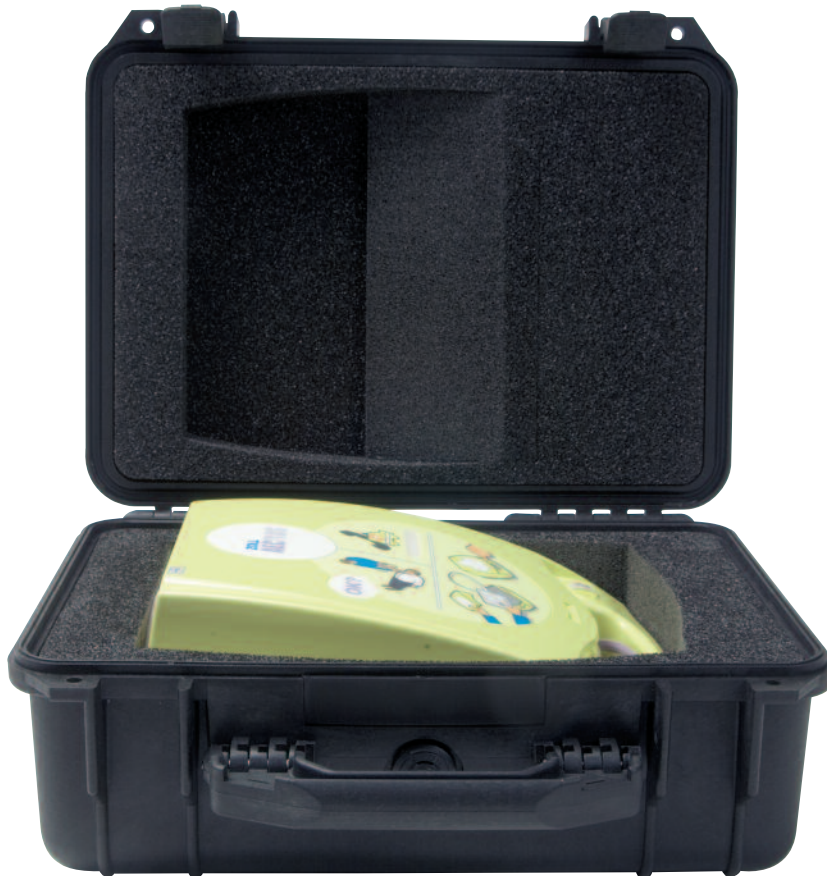
Small Case (19" x 15.4" x 7.6") (48.3 cm x 39.1 cm x 19.3 cm)