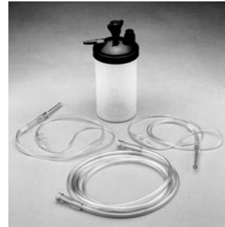
Start-up Kit Available with 7100 or 7600 humidifier

Disposable Humidifiers from Salter Labs are "truly single patient use products designed and engineered for long term durability and complete patient satisfaction".